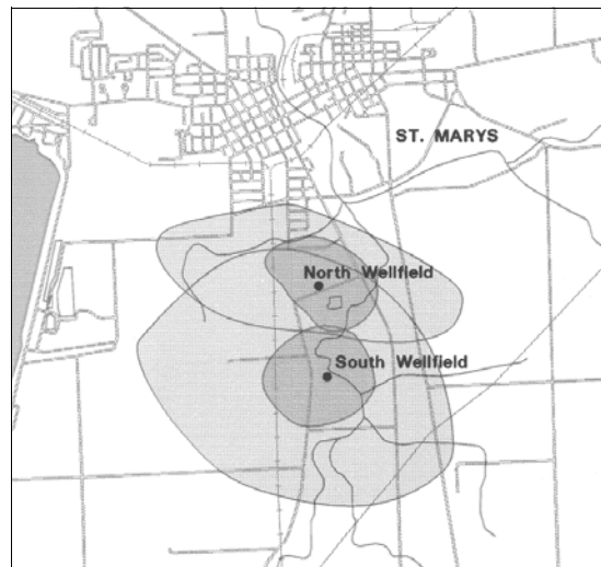
Our wellfields are shown above. Shaded areas need protected to ensure a continued supply of high-quality drinking water.

The City of St. Marys is in the process of adopting a Wellhead Protection Program (WHP) that will develop appropriate protective measures to minimize the likelihood of aquifer contamination. We recently received endorsement from Ohio EPA for the first two phases of the WHP. Phase one identified the shape and area of our wellfields and calculated one and five year time-of-travel boundaries. These boundaries are significant in that they show how long a contaminant, if discovered, would take to impact our drinking water source. Phase two included an inventory of potential pollution contamination sources in the newly delineated wellhead protection area. We can now move on to phase three, which consists of developing management practices to help prevent contamination of our wellfields. This is typically done through a committee represented by all those who may be affected by the management practices such as agriculture, industry, political subdivisions, business, etc. More information about the source water assessment or what consumers can do to help protect our aquifer is available by calling 419-394-4114.